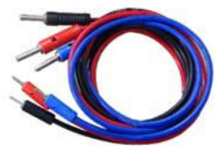
KEC10A Banana Cable Set