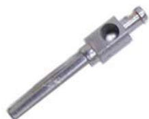
KEC10B Banana Connector Pin