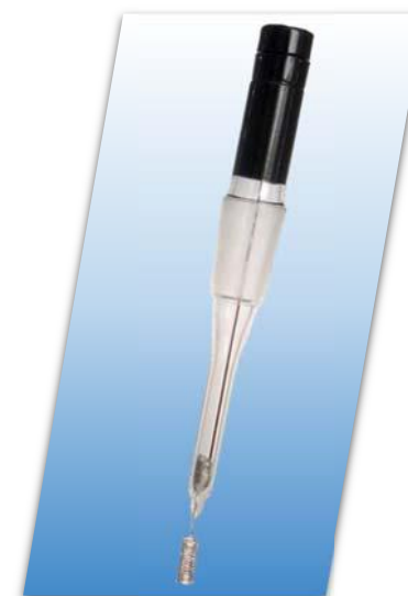
Platinum Coil Electrode Product ID: KCE02 and KCE03