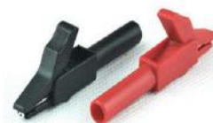
KA01 (Red), KA02 (Black) Alligator Clip